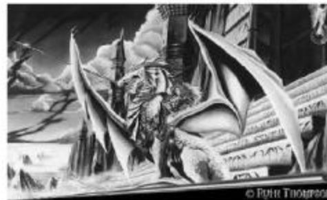
Art Courtesy of Ruth Thompson, Artist GOH 2003, Used with permission.